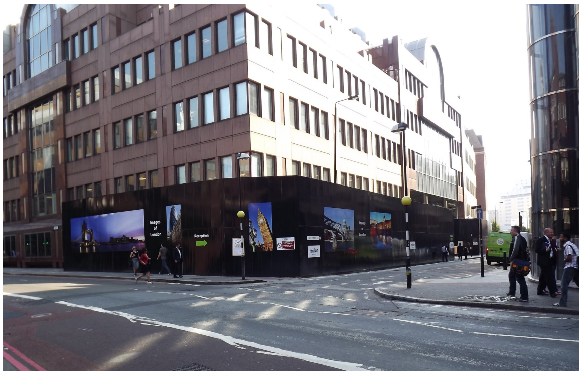
Left: Temporary black hoardings with full colour vinyls added in Alie Street, London E1.

Systems: K-K Ultraspan (external) K-K Perpetua (indoor)