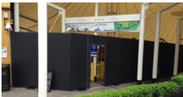
Left: An indoor hoarding creates a works compound within a garden centre at McArthur Glen, Bridgend, Wales.