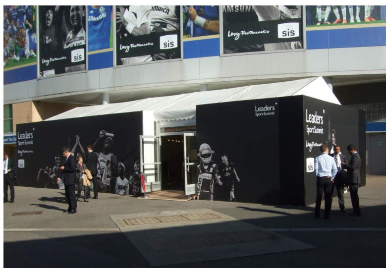
Above and left: Temporary black hoardings create a reception area at a Leaders' Sports Summit at Chelsea FC, London.

SECURE SUSTAINABLE 100% RE-USABLE & RECYCLABLE ZERO TO LANDFILL