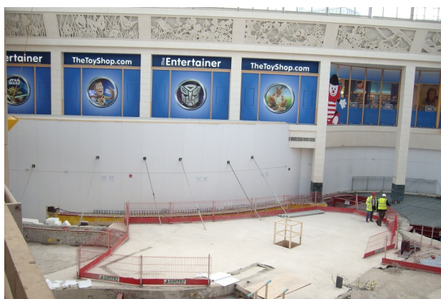
Different panels were used to hoard the ground floor (Soundmaster) and the first floor (Perpetua)