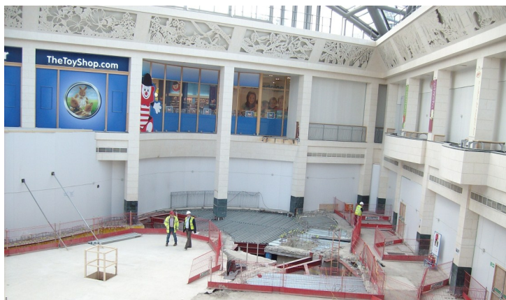
Business as usual as a secure worksite is created enabling major refurbishments to take place within

TEMPORARY HOARDINGS SUPERB RETAIL GRAPHICS FLEXIBLE, MODULAR, RE-USABLE SYSTEMS