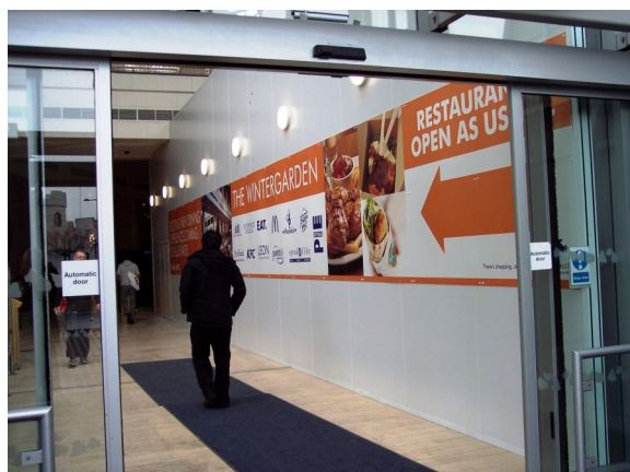
Hoarding with graphics were installed near to one of the main entrances of the shopping centre