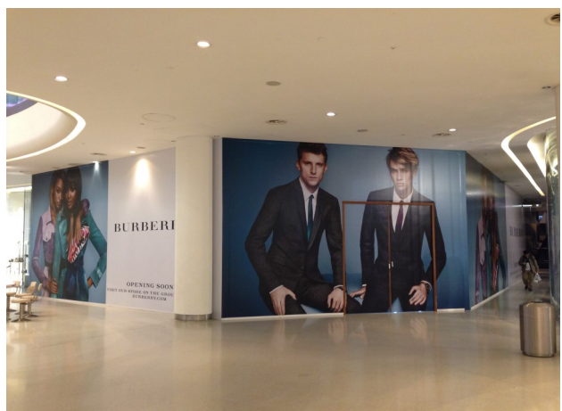
New graphics (above/right) were added in 2015.