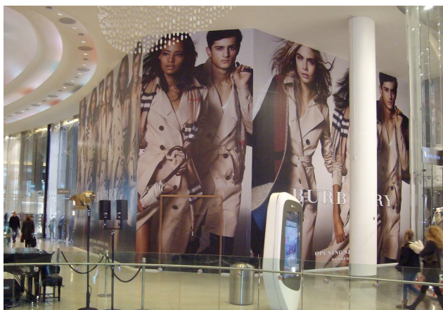
We installed the hoarding in October 2014.